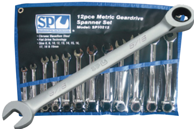
12PC METRIC 0° OFFSET GEARDRIVE WRENCH/SPANNER SET