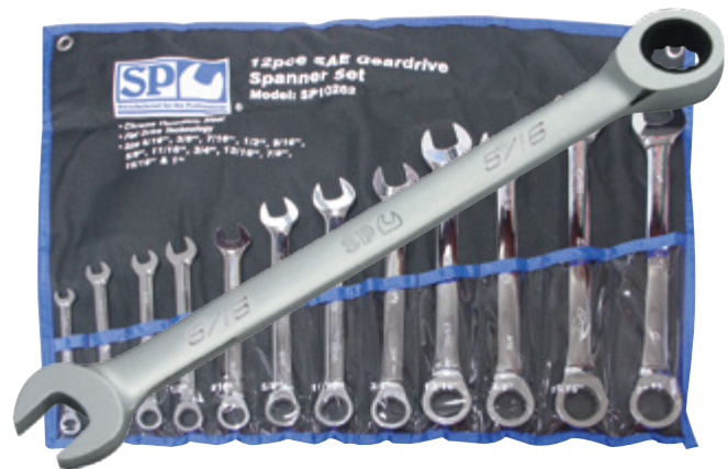
12PC SAE 0° OFFSET GEARDRIVE WRENCH/SPANNER SET