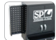
Dual Internal Sliding Tool Boards