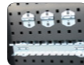
Adjustable Heavy Duty Tool Hooks