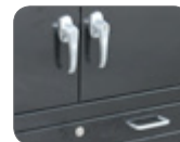
Lockable Drawer and Tool Drawer