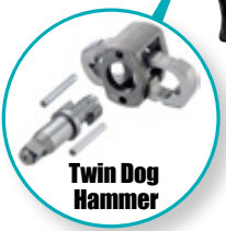
Twin Dog Hammer