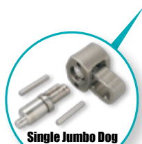
Single Jumbo Dog Hammer