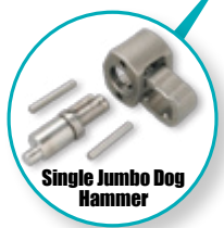
Single Jumbo Dog Hammer