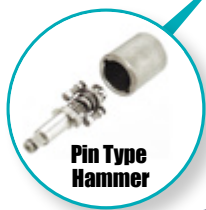
Pin Type Hammer