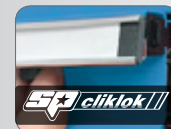
Drawer Locking System