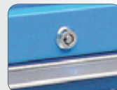
Key Locking System