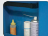
Side Storage Compartment