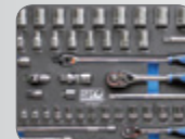
EVA Foam Storage