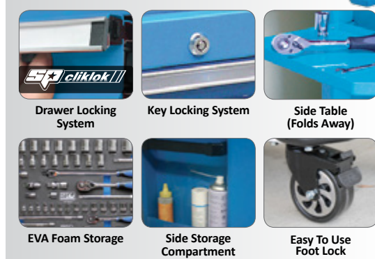
Drawer Locking System