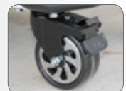
Heavy Duty Wheels

Images are for illustration purposes only, contents may vary.