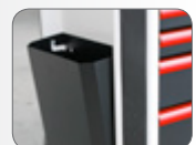
Removable Side Storage/Rubbish Bin