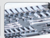
EVA Foam Storage