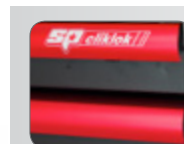
Soft Close Drawers with Locking System