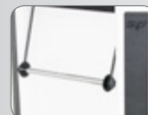
Paper Towel Holder