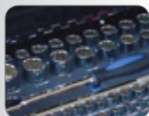
EVA Foam Storage System