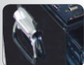
Heavy Duty Carry Handles