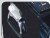
Heavy Duty Carry Handles