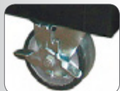
Swivel Wheel with Foot Lock