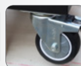
Swivel Wheel with Foot Lock

Images are for illustration purposes only, contents may vary.