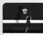
SP Key Locking System