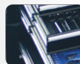
Heavy Duty 28 Ball Bearing Slides