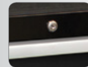
SP Key Locking System