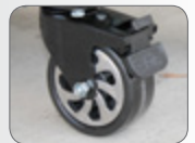
Heavy Duty Wheels