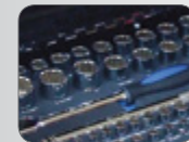
EVA Foam Storage System