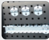
Adjustable Heavy Duty Tool Hooks