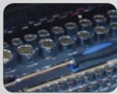
EVA Foam Storage System