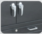
Lockable Drawer and Tool Drawer