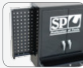
Dual Internal Sliding Tool Boards