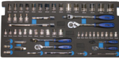
EVA Foam Tray Included