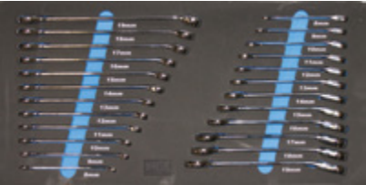
EVA Foam Tray Included