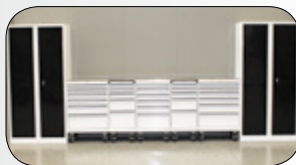
Joins together to storage on next page

*Tools & accessories not included. Images for illustration purposes only