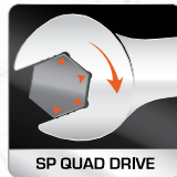
SP QUAD DRIVE — PATENTED DESIGN —

KIT INCLUDES SP's PREMIUM RANGE OF Combination QUAD DRIVE Spanners in Metric & SAE